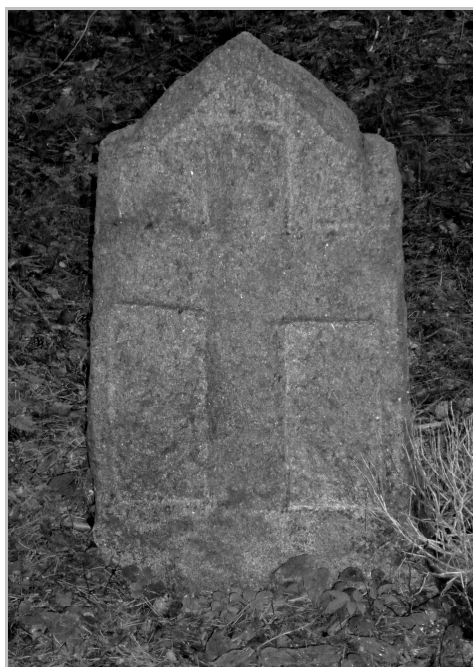
Photo 1. A stone gravestone without inscriptions in the disused Lutheran cemetery in the village of Kocioł Duży (Pisz Forest Division)

The highest total score was obtained by Lutheran cemeteries in Ruciane-Nida (15 points), Cudnochy (no 2) and Śwignajno (13 points each), Ukta (11), Karwica (9), Łuknajno, Lisunie, and Karp (8 each) (DŁUGO-ZIMA, DYMITYRSZYN & WINIARSKA 2012).